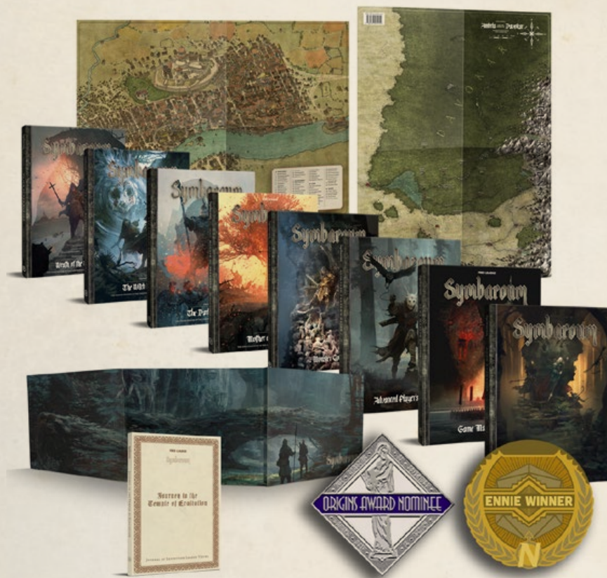
The Korinthia Bundle, featuring the four Core Books, as many setting and adventure books, along with a number of support products.

"The game that has inspired me most this year"